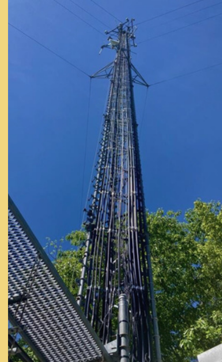
Radio tower in Lincoln County.

“What if there's a safety issue? What if it has nothing to do with the call itself or the patient's care but with our first responders? Our primary goal every single day is to take care of our citizens, and make sure every responder goes home. And this will help us make sure that happens.”